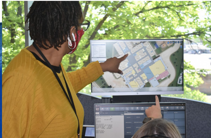
Image - Denco 9-1-1 telecommunicator accessing indoor map

Providing 9-1-1 Actionable Location Information